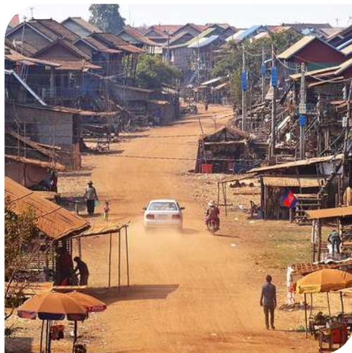
Tonle Sap Lake