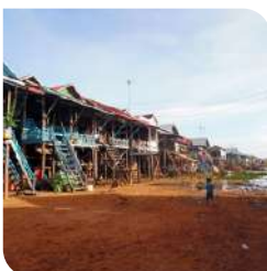
Tonle Sap Lake